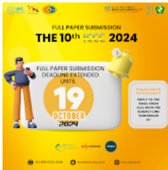
Full Paper Deadline ICCC.png 585K

Nindyo Cahyo Kresnanto <nindyo_ck@janabadra.ac.id> To: 10th iccc <10th.iccc2024@gmail.com>